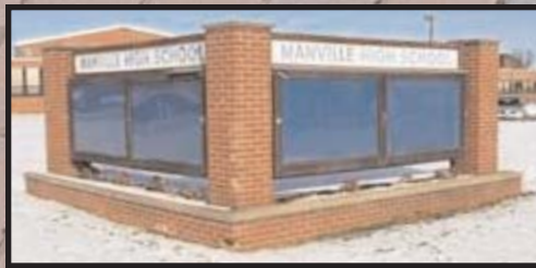
Currently at High School